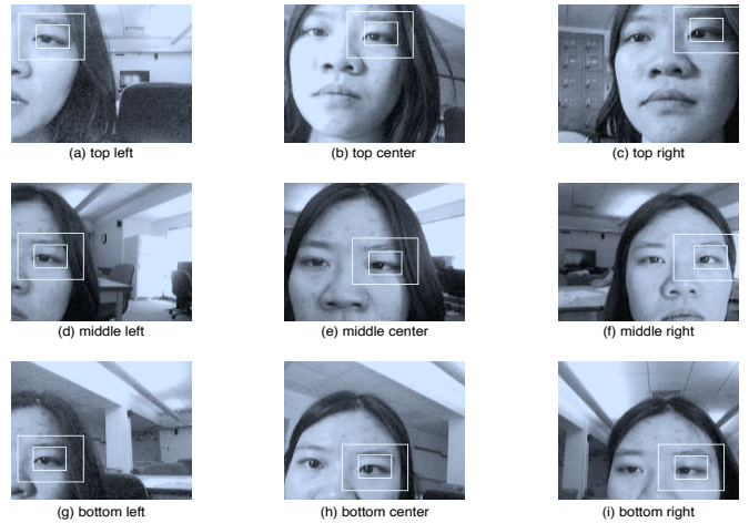
Figure 2: Eye capture using the Nokia N810 front camera running the EyePhone system. The inner white box surrounding the right eye is used to discriminate the nine positions of the eye on the phone’s display. The outer box encloses the template matching region.

template matching. The template matching function calculates a correlation score between the open eye template, created the first time the application is used, and a search window. In order to reduce the computation time of the template matching function and save resources, the search window is limited to a region which is twice the size of a box enclosing the eye. These regions are shown in Figure 2, where the outer box around the left eye encloses the region where the correlation score is calculated. The correlation coefficient we rely on, which is often used in template matching problems, is the normalized correlation coefficient defined in [18]. This coefficient ranges between -1 and 1. From our experiments this coefficient guarantees better performance than the one used in [13]. If the normalized correlation coefficient equals 0.4 we conclude that there is an eye in the search window. This threshold has been verified accurate by means of multiple experiments under different conditions (e.g., bright, dark, moving, not moving).