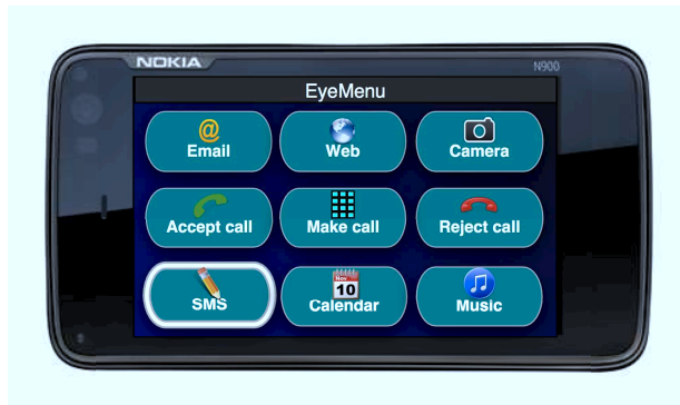
Figure 4: EyeMenu on the Nokia N900. While looking the display, a button is highlighted if it matches the eye position on the display. The highlighted button is ready to be “clicked” with a blink of the eye. In this example, the user is looking at the SMS button and the SMS keypad is launched by blinking the eye.

We are currently working on improving the creation of the open eye template and the filtering algorithm for wrong eye contours. The open eye template quality affects the accuracy of the eye tracking and blink detection algorithms. In